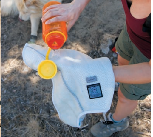
5. Recharge the coat with steps 1 through 4.