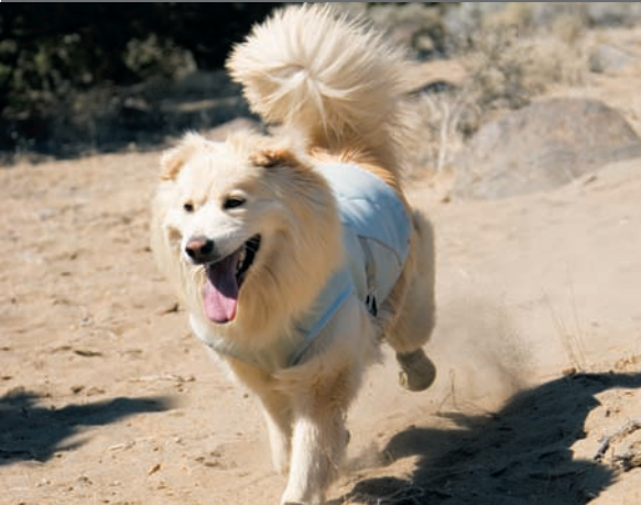
4. Get on the go!