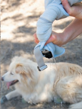
2. Wring out excess.