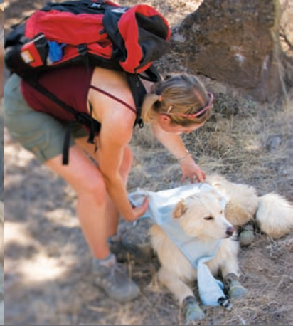
3. Slide dog's head through neck hole and fasten the buckles at the rib cage.