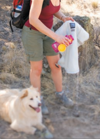
1. Soak coat completely with cold water.